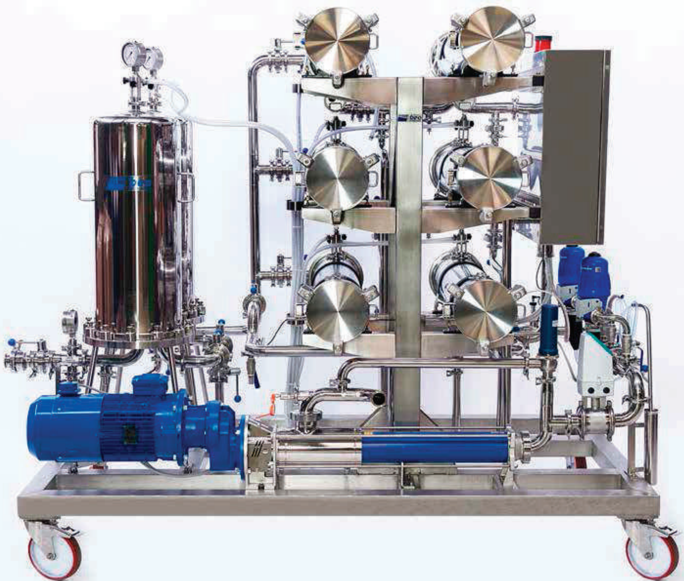
MOBILE PILOT FILTRATION PLANT